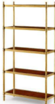
"Edwardian Brass"