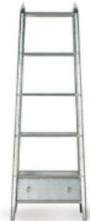
"Mirrored Étagère" horchow.com